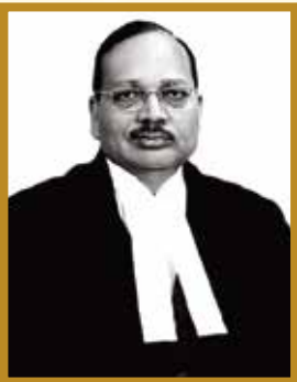
Hon'ble Mr. Justice Surya Kant Judge Supreme Court of India & Executive Chairman, National Legal Services Authority (NALSA) & Chief Patron, CLEA