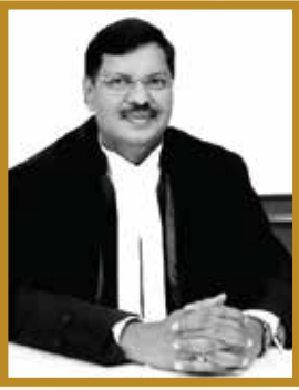
Hon'ble Mr. Justice Bhushan Ramkrishna Gavai Chief Justice of India